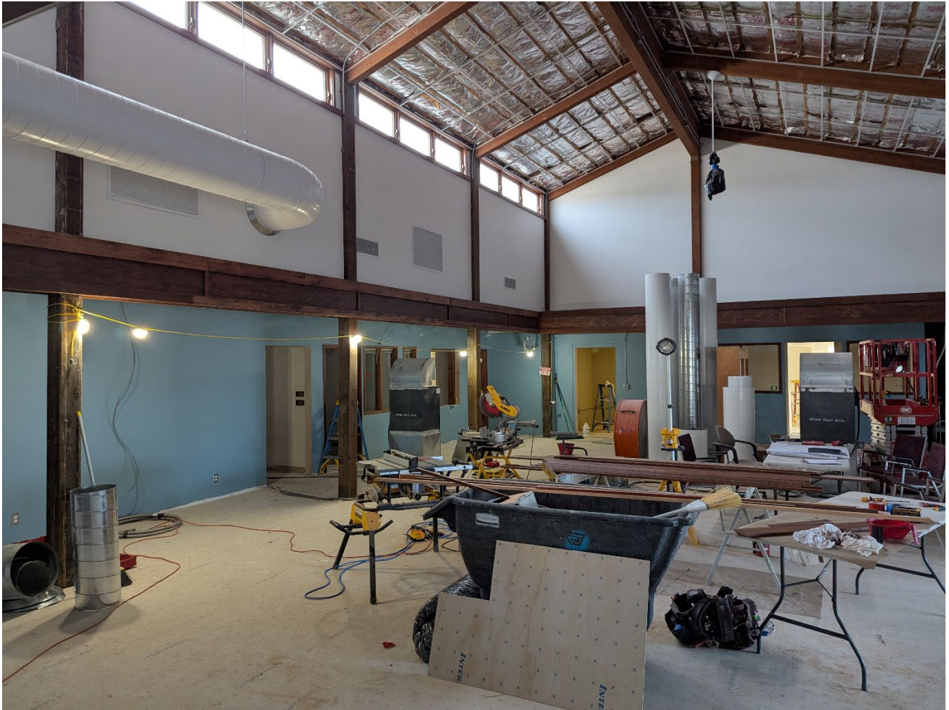
Main office space, image taken from the north end of the room.