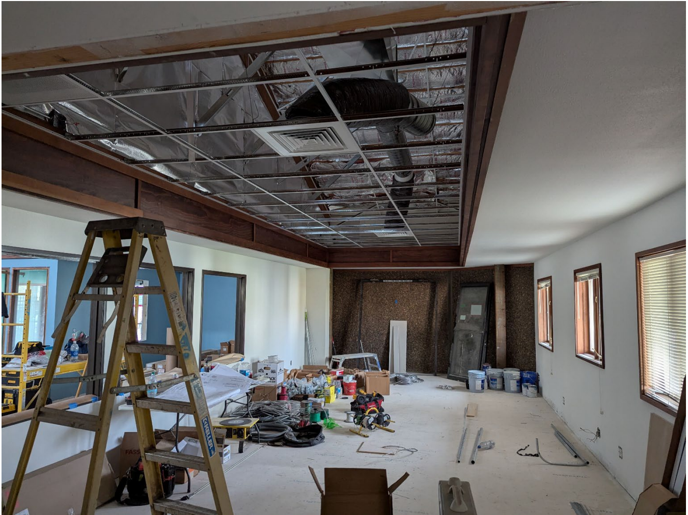
Main conference/board room. Ceiling tiles, flooring, and furnishings to come.