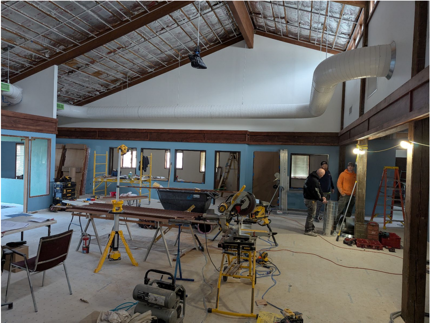
Main office space showing the open ceiling design, image taken from the south end of the room. Still in need of lighting, ceiling tiles, flooring, furnishings, and finish work