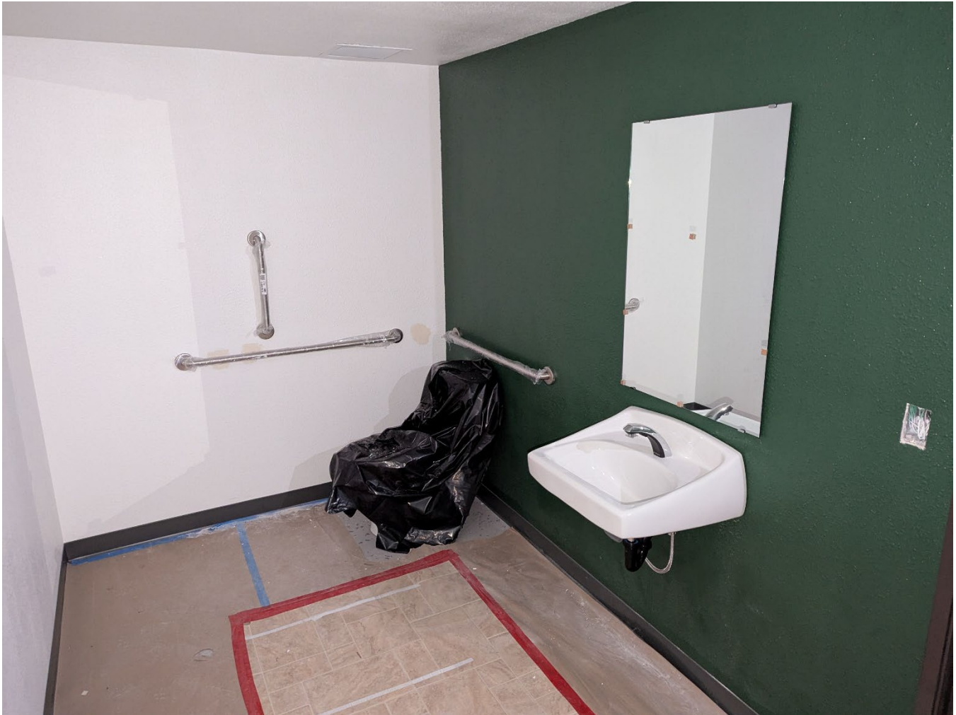
One of the main restrooms, still in need of some fixtures and lighting. Paper and scrap flooring installed for new flooring protection. All restrooms now meet ADA requirements.